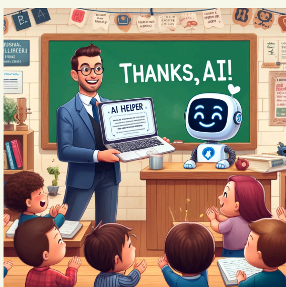
(“Thanks, AI,” 2024)

Why? Differentiation helps maintain academic integrity by distinguishing your contributions from the AI's output. You don't want AI getting credit for your output, nor do you want people to attribute an AI's errors to you. Be clear about the boundaries.