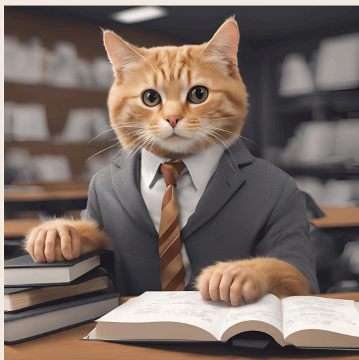
("Scholar Cat" 2024)